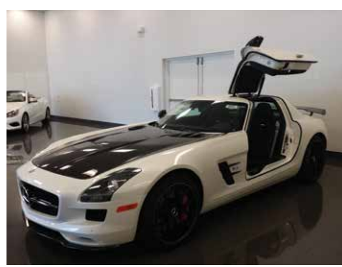
2015 MERCEDES SLS AMG GT FINAL EDITION